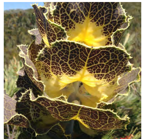
Hakea victoria