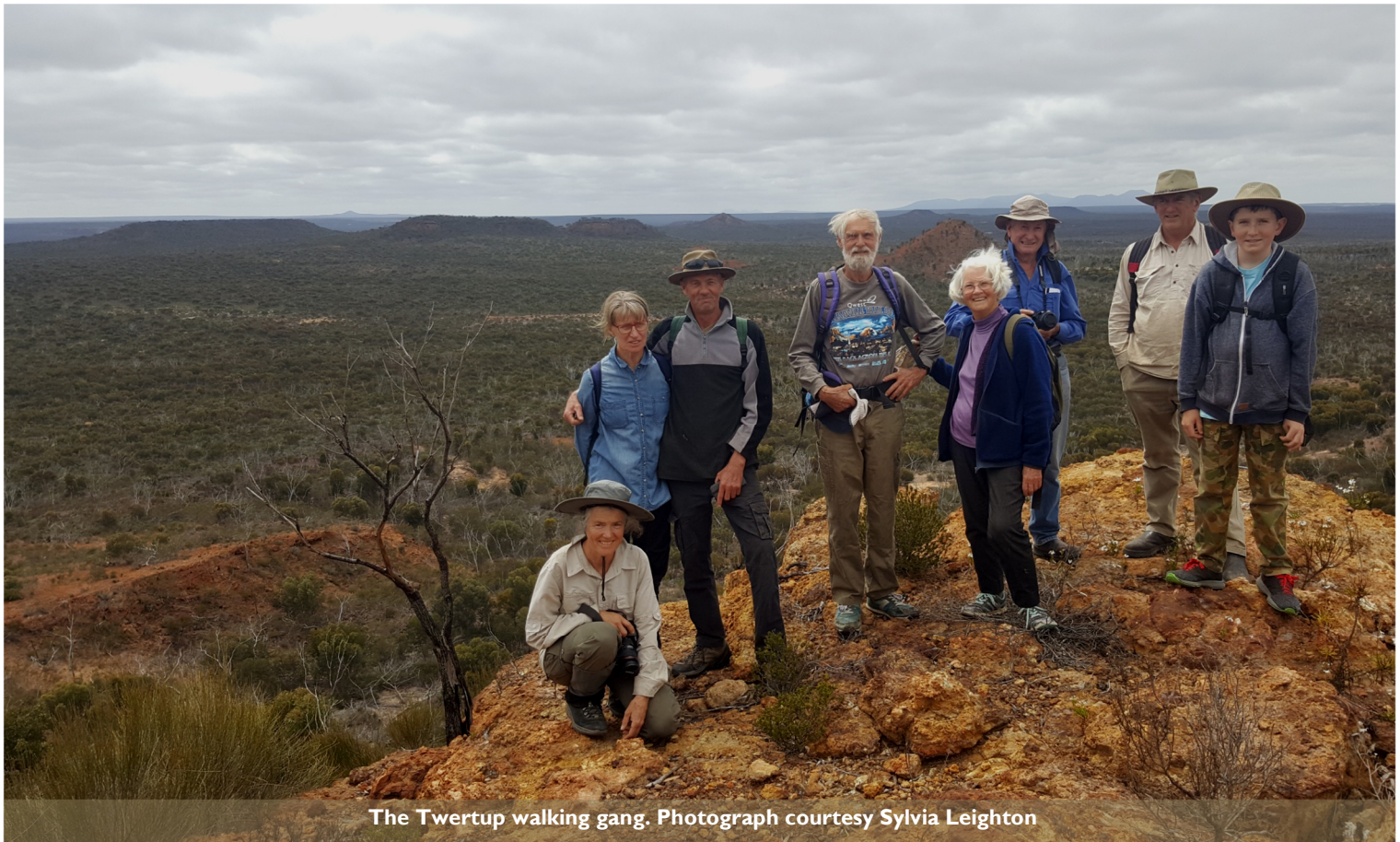
The Twertup walking gang.