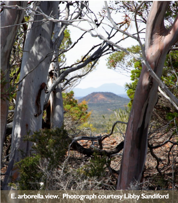
E. arborella view.