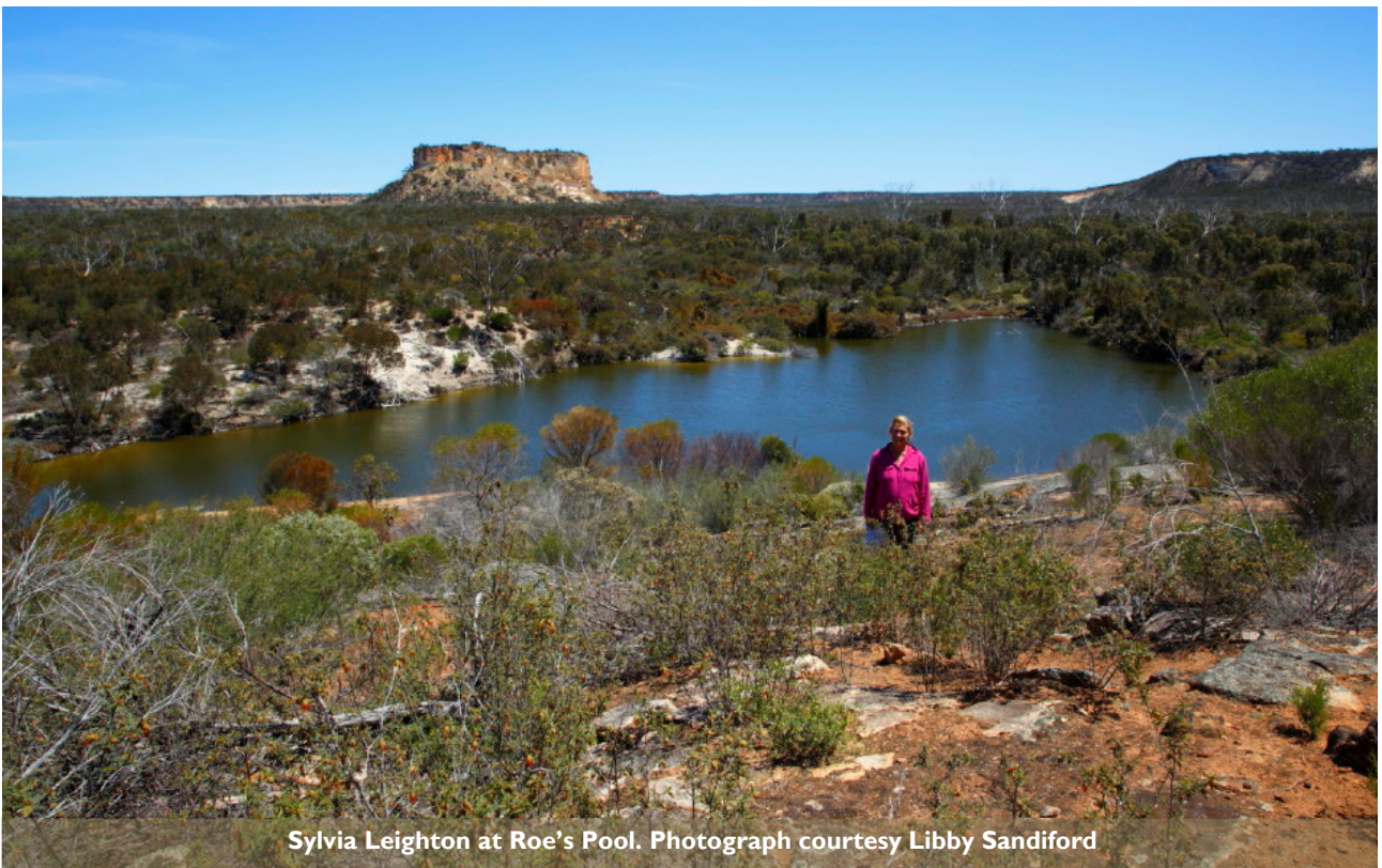
Sylvia Leighton at Roe's Pool.