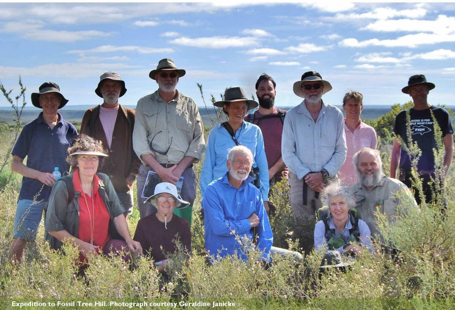
Expedition to Fossil Tree Hill.